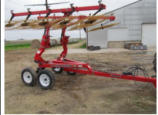
Ogden Hybrid Hayrunner 10 wheel hayrake MK100-36 Westfield 10" x 36' auger with swing hopper older 8" x 60' auger with swing hopper Harvest International 10" x 72' auger with swing hopper

Kuhn Knight 8132 tandem axle spreader 12715 Legend 15' batwing mower older Gehl 100 Mixer Mill MKT Red Devil 3 point snowblower