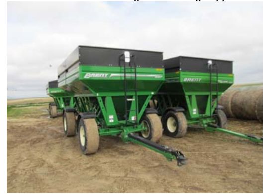
3 Brent 544 gravity boxes Brent 557 gravity box

Sometimes changes occur so visit web page often PHOTO I.D. REQUIRED TO OBTAIN BIDDING NUMBER NO I.D. MEANS NO BIDDING NUMBER