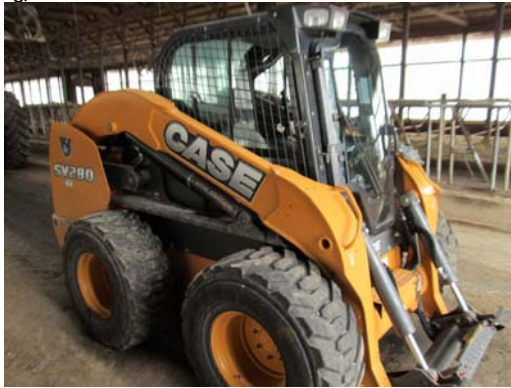
2015 Case SV280 skid loader, 3383 hours, NFM412132