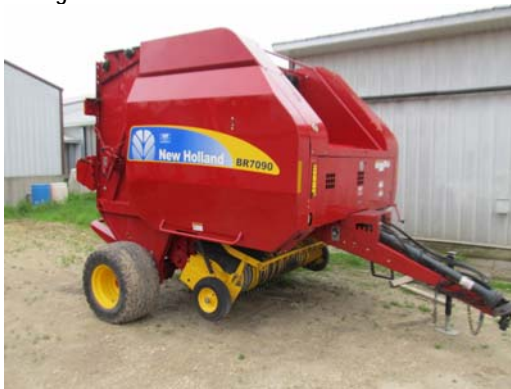
New Holland BR7090 round baler with net wrap, approx 7000 bales MORE PHOTOS ON WEB PAGE

White 6122 (6100) twelve row 30" planter, individual row shutoffs, corn & bean plates 2325 Landoll 5 shank ripper 6200 Krause 27' soil finisher Patz 1200 Series 500 TMR