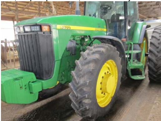
1998 JD 8300 MFWD tractor, 9329 hours, RW8300P021141, duals, front fenders, front weights, quad hydraulics, 16 speed power shift, has Auto Steer