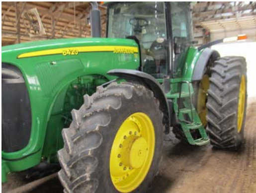
2003 JD 8420 MFWD tractor, 8164 hours, new motor at 5000 hours, RW8420P011537, duals, front fenders, front weights, triple hydraulics, 16 speed power shift, Auto Steer ready

All equipment will be moved into our pasture and will be available to view starting Monday June 24th. There is livestock in the pasture so gates are locked. We recommend all items be removed sale day or very shortly thereafter so attend prepared.