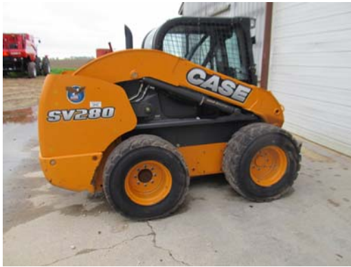
2016 Case SV280 skid loader, 3315 hours (air ride seat not working), NGM415990