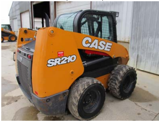
2018 Case SR210 skid loader, 1247 hours, NJM444948 skid loader buckets tire scraper for skid loader Mensch Side Shooter (sand shooter) Bradco silage bunker defacer