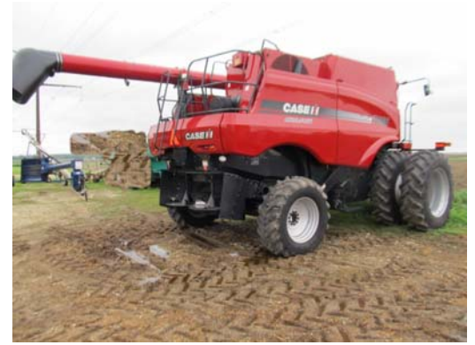
2010 Case IH 7088 Axial Flow combine, duals, Case Pro 600 monitor, 1971 engine hours, 1459 rotor hours, Y9G002896, sells with reserve Case IH 2208 corn head Case IH 30' bean head Univerth H25 head mover

White 6122 (6100) twelve row 30" planter, individual row shutoffs, corn & bean plates 2325 Landoll 5 shank ripper 6200 Krause 27' soil finisher Patz 1200 Series 500 TMR