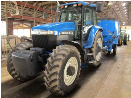
1997 Ford New Holland MFWD 8770 tractor, 8674 hours, 9821233, duals, front fenders, front weights, 16 speed power shift ... currently has Bale Command Monitor that will sell with the New Holland BR7090 baler