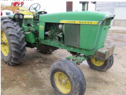
1966 JD 4020 power shift diesel tractor, open station, 4700 hours on motor, T213P135783R