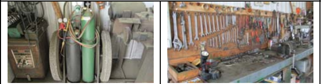
floor model hacksaw with electric motor bench vise hand made wooden shop parts bin transfer pump & electric motor 3/4" drive socket set 1/2" drive socket set floor jacks light duty moving dolly smaller rollabout tool box C clamps, wrenches, log chains, and many other smaller hand tools ladders several power tools of various kinds a few milk cans Sears bench top grinder transfer tank with pressure pump Clarke part washer manually operated tire changer & tools approximately 12' wide rolling hoist stand with two 1 ton chain hoists