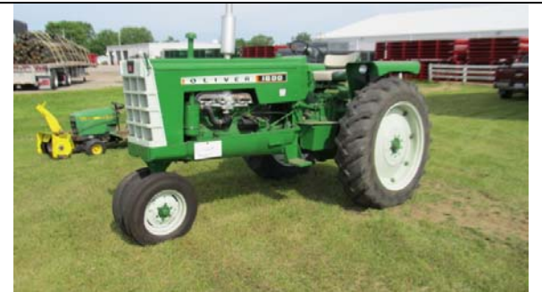
1963 Oliver 1600 narrow front tractor, rear fenders, new front tires, standard hitch, hydraulics, 7750 hours, 128789-602