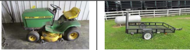
Craftsman 180 amp arc welder acetylene tanks & cart (no titles) wall mount drill press with electric motor and bits of all sizes iron welding table with small anvil & leg vise