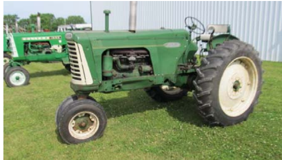
1960 Oliver 880 narrow front tractor, rear fenders, standard hitch, hydraulics, unknown hours, SN92174-873