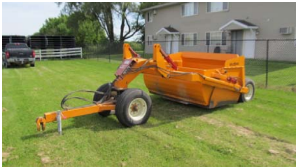
like new Big Dog 6 1/2 yard dirt scraper/mover