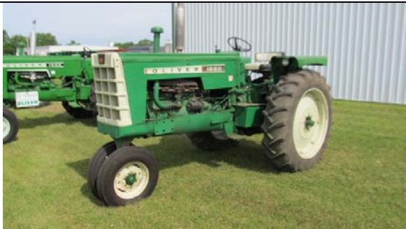
1965 Oliver 1650 narrow front tractor, rear fenders, new front tires, 3 point & standard hitch, 6817 hours, SN156396-456