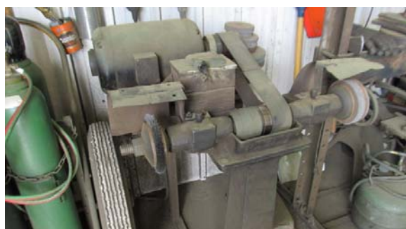
floor model 2 wheel grinder with 5HP 220V motor