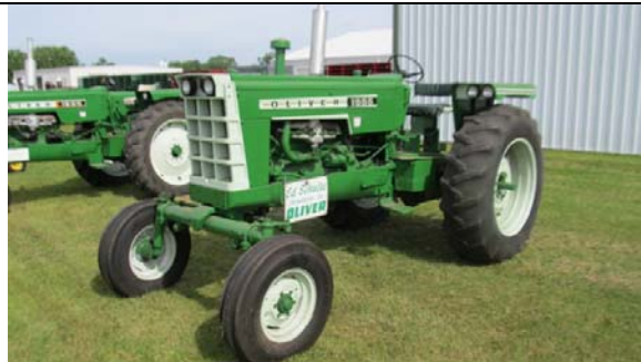
1973 Oliver 1555 wide front tractor, rear fenders, new front tires, standard hitch, 6868 hours, SN236910-504