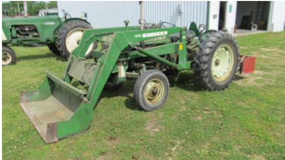
rare (1 of the last 500 made) 1974 Oliver 550 utility tractor, rear fenders, 5225 hours, SN240851-019, sells with Oliver 1510 step on hydraulic loader