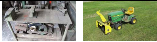
John Deere 185 Hydro riding mower